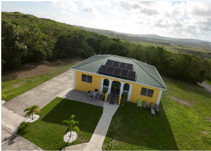
SPF solar systems have been designed to ensure that the homeowner realizes a savings on their utility bill, inclusive of the monthly loan payment, of at least 10% of what their typical power bill was prior to installation.

VIEO is pleased to announce that the final solar and battery behind-the-meter microgrid underwritten by the Solar Plus Financing (SPF) Pilot Program has been commissioned, and that all 31 loans executed during this cycle of the loan program have been successfully closed. SPF is a $0 down low interest solar loan program funded by the US. Department of Energy that aims to bring relief to Virgin Islanders living with high utility bills while further bolstering the territory's goal of enmeshing resilience into every corner of island life.