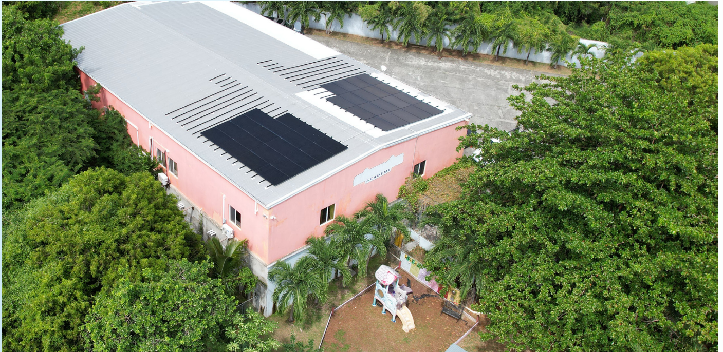
The Happy Faces II Academy will be the first of nine childcare centers that VIEO will harden with solar electric systems and battery energy storage solutions thanks to the Community Electrical Innovations grant program.

T he first behind-the-meter solar and battery microgrid funded by the Community Electrical Innovations (CEI) grant program has been awarded to ProSolar Caribbean to install 10kW solar system and 40.5 kWh battery at the Happy Faces II Academy later this spring. CEI has been designed to harden community based organizations that provide critical services to vulnerable populations in the Virgin Islands. And aims to reduce the burden that high utility costs place on their operations, while reducing the loss of services their clients face due to power outages.