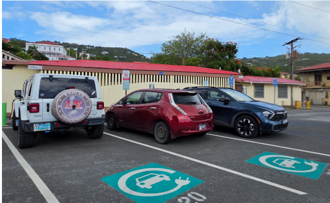
An EV charges up at one of six newly installed chargers located in the Fort Christian parking lot on St. Thomas.

V IEO's network of public electric vehicle (EV) chargers expanded significantly in 2026 with the addition of 16 Level II chargers in the St. Thomas—St. John District . The chargers join a growing ecosystem of charging infrastructure constructed by VIEO that is augmenting refueling options for EV owners in both districts.