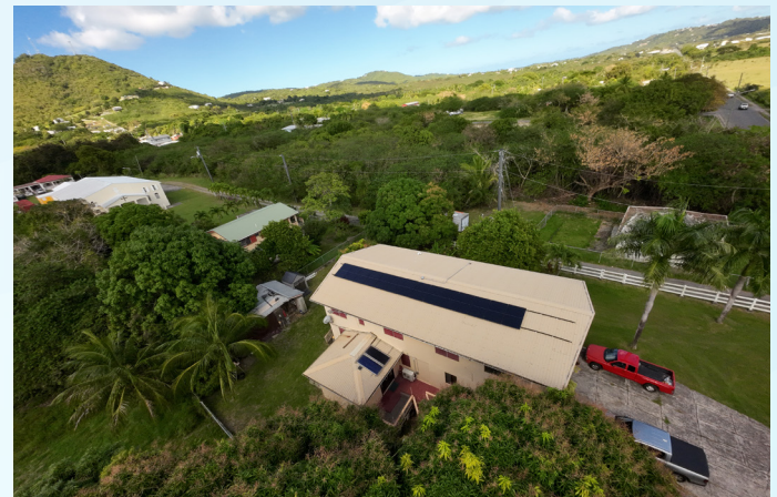
In order to qualify for SPF, applicants had to be bona fide Virgin Islands residents. (Photo by Lasiba Knight).