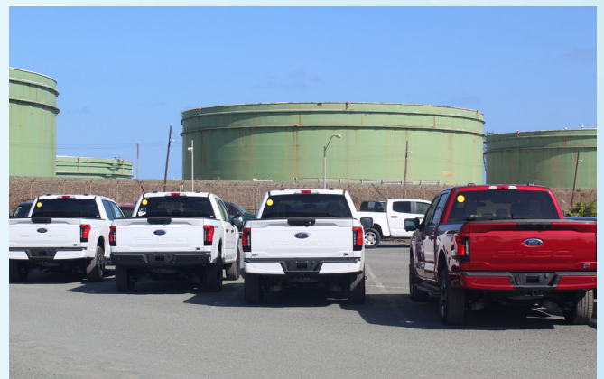
VIEO's Government Operations Fleet Efficiency and Electrification Transformation (GO FLEET) initiative has facilitated the procurement of dozens of EVs for public service use, vehicles that have markedly cut down not only on governmental fuel costs and polluting emissions. (Photo by Lasiba Knight).

VIEO partnered with Metro Motors VI to give the dealership the support it needed to establish EV service centers in both districts, a first in the territory. The award of the $500,000 subgrant, facilitated through U.S. Department of Energy funding, will enable the sale of EVs in the territory by an affiliate of an American automobile manufacturer.