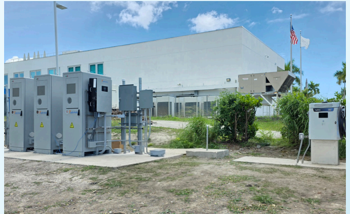
The first DC fast charger in the territory is located at the University of the Virgin Islands Research and Technology Park.

On St. Croix, motorists can plug into public chargers located at the Christian "Shan" Hendricks Vegetable Market in Christiansted, adjacent to the Virgin Islands Economic Development Agency's office in the William D. Roebuck Industrial Park , and at Ziggy's Island Market . Charging on VIEO's network is currently free of charge thanks to funding provided by a U.S. Department of the Interior grant. In the future, VIEO will require that patrons are charged for the charge they receive.