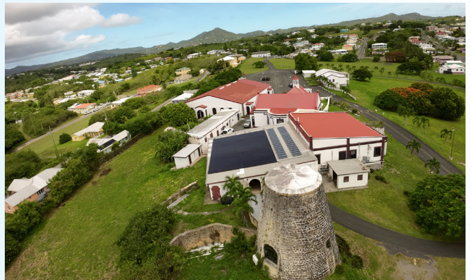
The Sts. Joachim and Ann Catholic Church in Barren Spot was a beneficiary of VIEO's locally funded Solar Congregations Pilot Program.