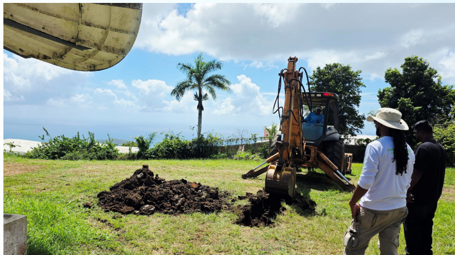
VIEO broke ground this May on a 70 kW solar farm and 500 kWh battery energy storage system at WTJX's Mountain Top broadcasting facility. (Photo by Kyle Fleming).

The WTJX microgrid is built around over 500 kWh battery energy storage system , paired with roughly 70 kW of solar PV , engineered to deliver firm, dispatchable power that can smooth transitions, absorb disturbances, and keep operations steady even when the grid is not. In practical terms, the battery is what turns renewable energy from "available when the sun shines" into "available when you need it."