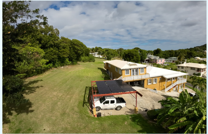
This roof mounted solar system is one of 31 solar arrays installed due to VIEO's SPF program.

In total VIEO awarded more than $860,000 in loans to homeowners , enabling them to install 418 kWh of battery storage and 164 kW of solar generation . The loans, which averaged approximately $27,700, required no upfront payment and carry an interest rate of 1 percent. Clients will repay the loans via an on bill financing mechanism that will be added directly to each customer's utility bill. SPF was a joint initiative between VIEO, WAPA, and the Virgin Islands Economic Development Authority (VIEDA).