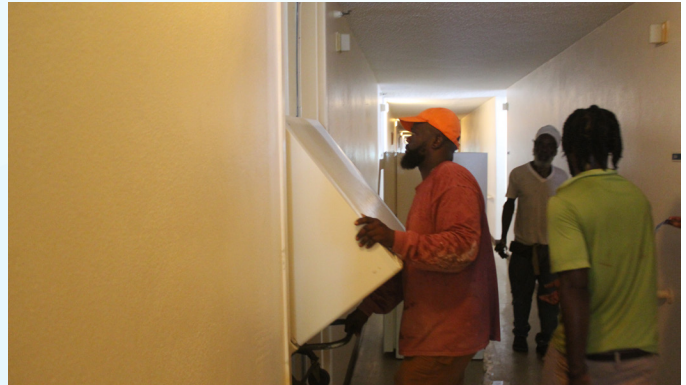
Crews work to remove antiquated and inefficient refrigerators at the Ebenezer Gardens senior independent living facility on St. Thomas.

In October VIEO completed the final installation of WAP retrofit items slated to be installed at the Ebenezer