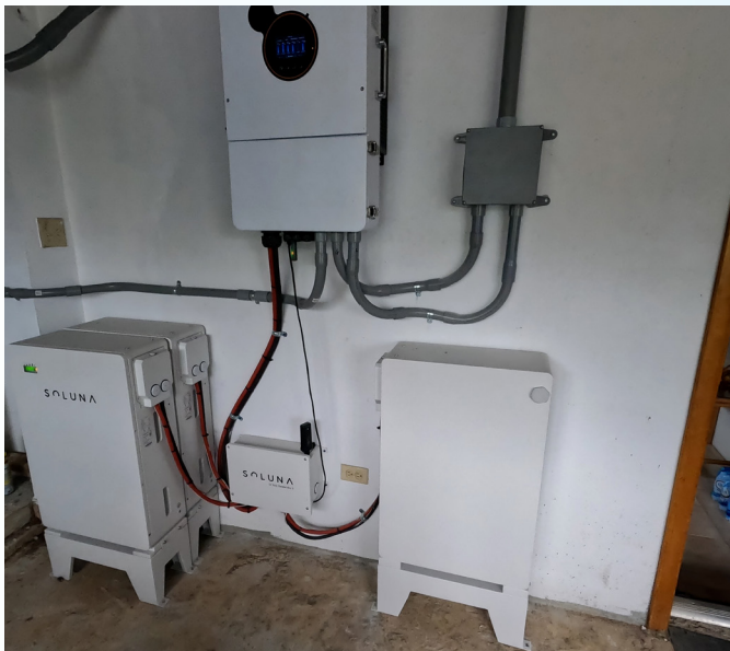
The VIBES program aims to give Virgin Islanders the tools they need to ride out transient faults and more serious power outages that can occur in the territory by offering residents a rebate of up to $6,000 on eligible battery energy storage solutions.

Thanks to the subsidy VIEO estimates that Virgin Islanders have been able to purchase $1.1 million worth of energy storage.