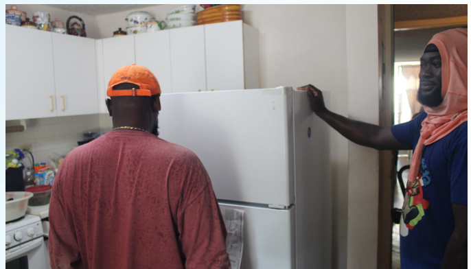
On top of items like LED lightbulbs, low flow shower heads, and faucet aerators, the seniors also received new refrigerators, window air conditioners, mini split HVACs, and efficient hot water heaters.

During the last WAP cycle, VIEO completed over 130 energy audits and home retrofits , providing clients with energy efficient appliance upgrades worth on average over $2,900 per household. Over 50 households on St. Thomas , and more than 80 on St. Croix received the benefit of greater home energy efficiency.