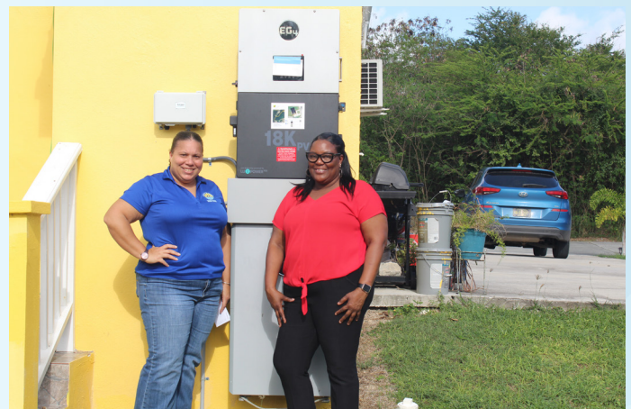
A majority of SPF clients opted to include battery energy storage systems in tandem with their solar arrays. (Photo by Lasiba Knight).