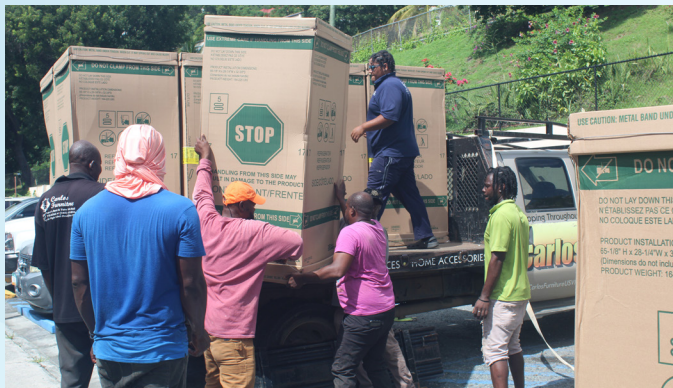
VIEO contractors unload brand new, energy efficient refrigerators that will replace old and outmoded models at Ebenezer Gardens.

WAP is designed to help low income families invest in next generation appliances and smart solutions. These proven products have been rigorously tested to ensure that they use less energy and other valuable resources to produce similar or improved results to the items they are replacing. The program places a priority on easing the burden that households struggling to make ends meet face as they support elderly, disabled, or minor dependants; placing them at the front of the line for resource distribution.