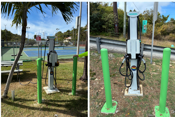
The two chargers located at Enighed Pond on St. John are capable of delivering just over 10 kW of power to an EV's battery cells, marking them out as Level II chargers.

The pedestal mounted chargers are capable of delivering over 10 kW of power and can recharge a vehicle four to eight times faster than is possible when plugging into a typical household outlet. Six of the new chargers have been installed at the Fort Christian Parking Lot , four at the Red Hook Plaza , and two each at parking lots located adjacent to the Lindquist Beach , the Enighed Pond , and the Giff Hill School .