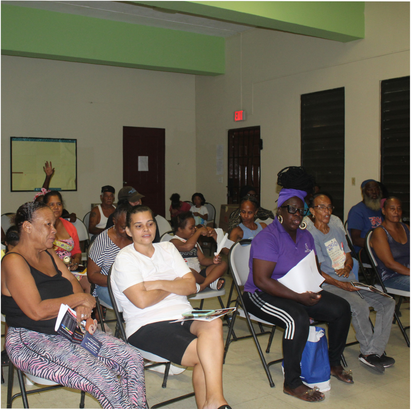
Residents of the D. Hamilton Jackson Housing Community attend a WAP informational session.