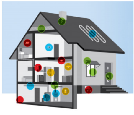
VIEO, delivering relief now